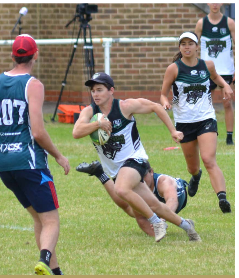
Elite NTS / R2 / Banbury