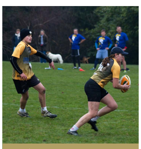
outh East / Regional Club Championships

In 2022 the ETA will be supporting the regions to run a more coherent Regional Development Series throuahout the summer