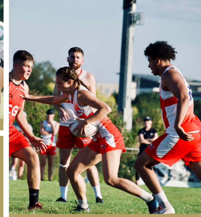
Mixed Open / Autumn International Series / Mancheste

It was fantastic to have a number of teenagers not just play, but play very well at this level, and it bodes well for our future