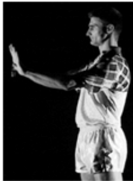
Defenders Back 10M