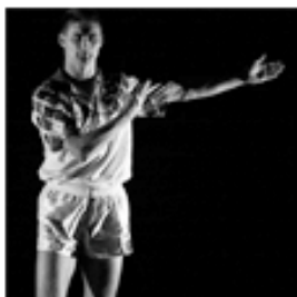
Penalty - Offside (1)