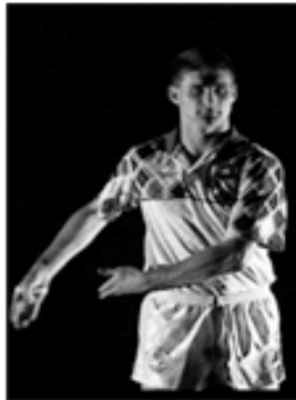
Forward Pass (1)