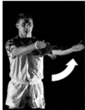
Forward Pass (2)