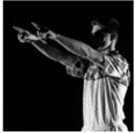
Rest of Match Dismissal