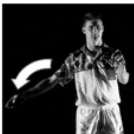
Over-stepping Mark (2)