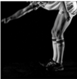
Incorrect Rollball (1)