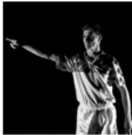
Period Dismissal (2)