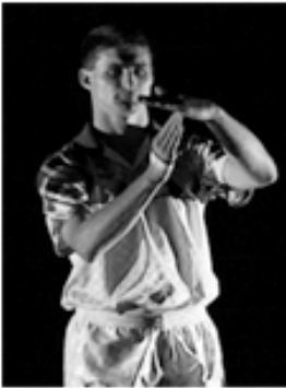
Period Dismissal (1)