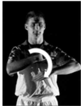
Playing On After Touch