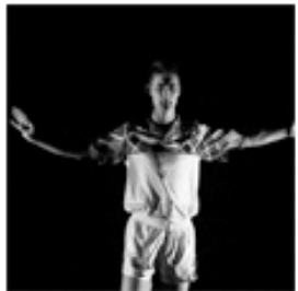
End of Match