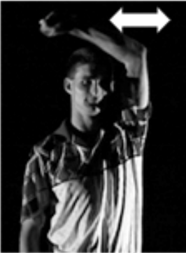
Six More Touches