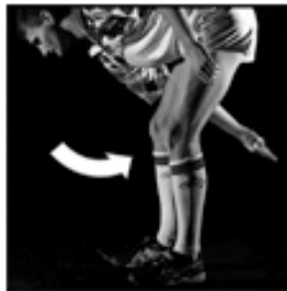
Incorrect Rollball (2)