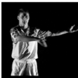
Over-stepping Mark (1)