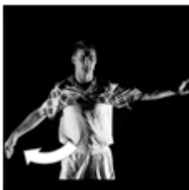
Penalty - Offside (2)