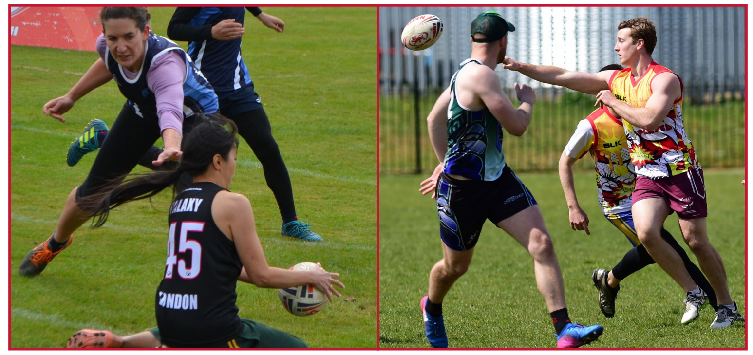
England Touch's national club tournaments continued to go from strength-to-strength in 2017 with a record number of teams and players taking part.

Bareback Riders had a superb season, winning three of the four Belief NTS titles on offer during the season – coming second in the fourth – and going on to lift the overall title after overcoming a spirited Wigan Touch Warriors outfit that pushed them right to the wire in a fitting climax.