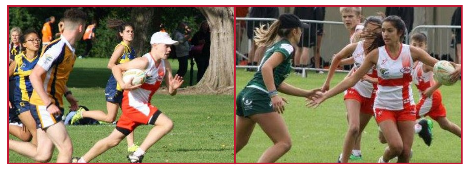
It was a busy weekend in Dublin for the England teams in the 2017 Junior Touch Championships.